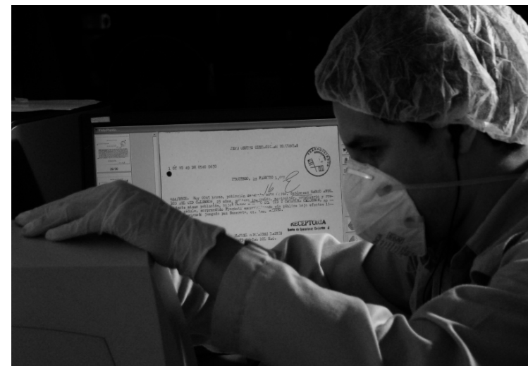
Archivist of the National Police Historical Archive of Guatemala.

Evidence. Professional practice is to hold evidence in separate “evidence rooms” or storage places (vehicles taken into custody are in designated parking lots); however, sometimes evidence is found within case files. While evidential materials are often objects (weapons, for example), other evidence may be books and letters and photographs and archives seized during raids or taken from persons arrested. Evidence may be held locally or may be held in one or more central locations. Logs of evidence should exist.