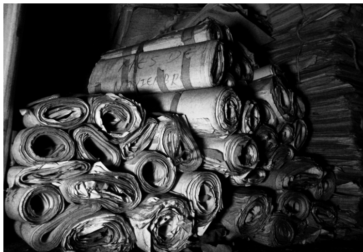
Documents in the National Police Historical Archive of Guatemala.